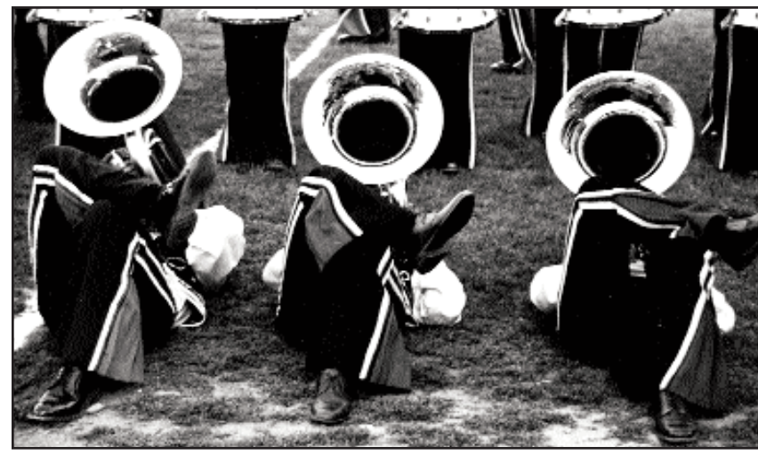
The Muchachos' contras "relax" during the concert number at a show in the early 1970s (photo by Leo Derlak from the collection of Drum Corps World).

Space limitations preclude listing all the repertoires, which can be found on the Web at www.corpsreps.com. The corps placed sixth at the American Legion Nationals in