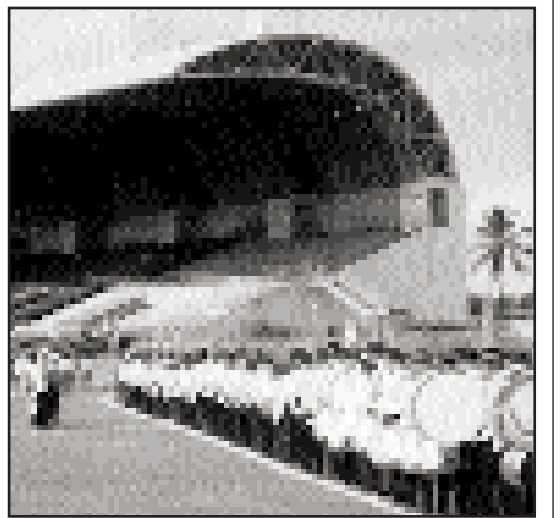
The Muchachos at the 1963 American Legion Prelims in Miami Beach, FL.

Tragedy struck the corps in 1964, when a