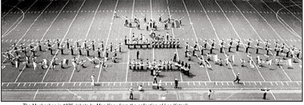
The Muchachos in 1975.

The disqualification ultimately proved to be the death penalty for the Muchachos. The