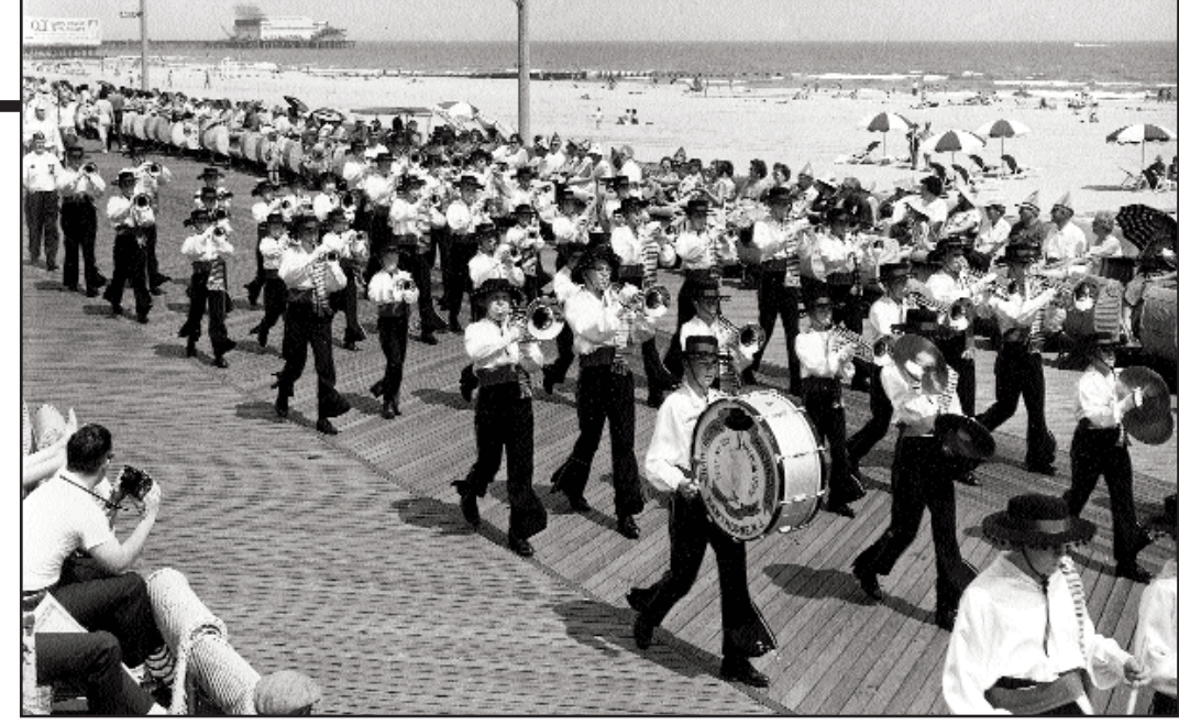
The Muchachos in a 1963 parade at Atlantic City, NJ, on the boardwalk.

charter member lost his battle with Hodgkin's disease. The corps marched a competition the day after his death and then stood honor guard over his casket and at his